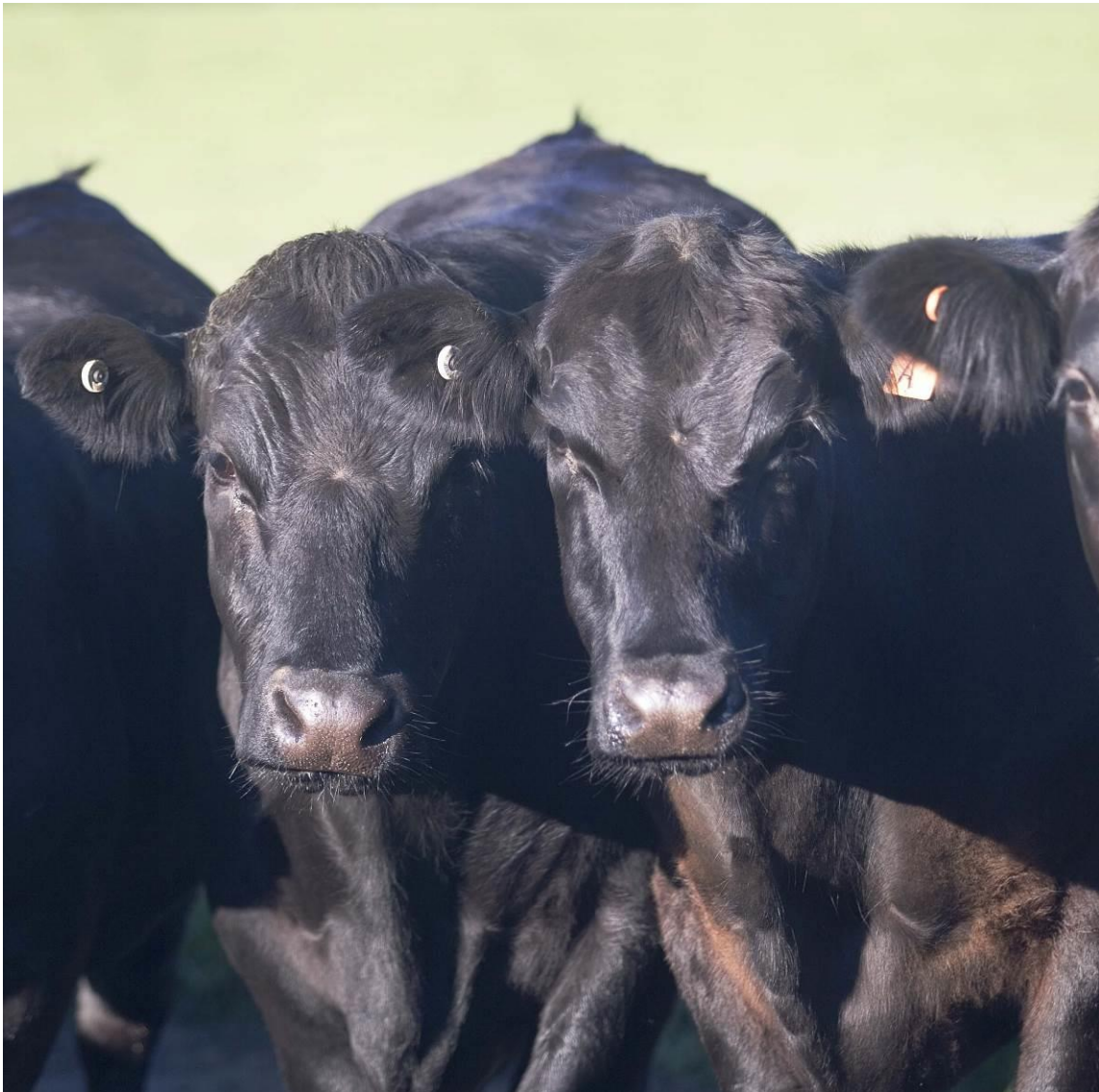
Photo: Cattle with NLIS tags.

Not all areas will have appropriate impounding facilities and staff may not be immediately available, so property owners and community members may play a role in assisting to contain stray animals, if it is safe to do so.