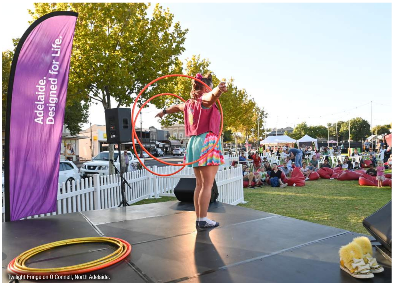
Twilight Fringe on O'Connell, North Adelaide.

This articulation of a clear, long-term shared vision and strategy, with specific high-value projects, demonstrates the strong partnership approach between City of Adelaide and the state government, which will further underpin future city planning.