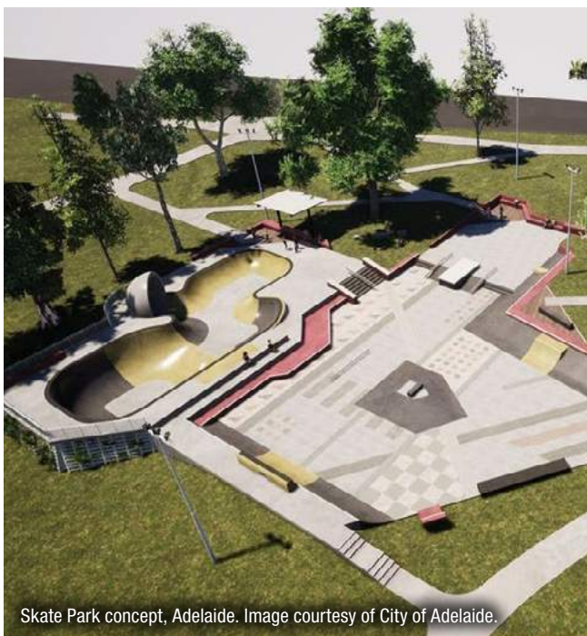
Skate Park concept, Adelaide.

Our Kaurna heritage was honoured with the first Kaurna Kardla Parranthi Bio-Cultural Burn in the Adelaide Park Lands in more than two hundred years.