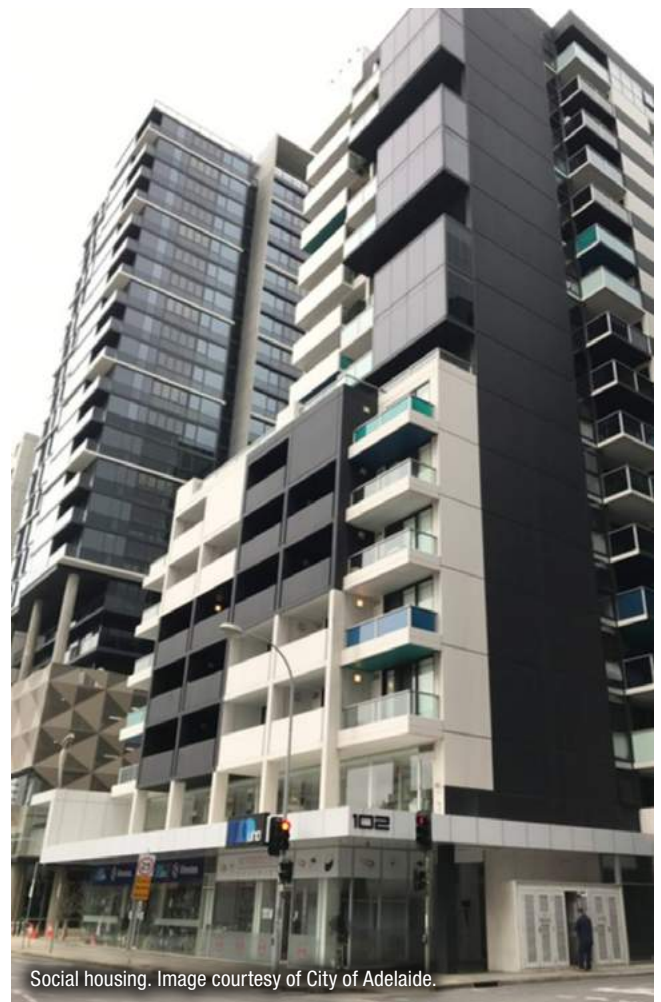
Social housing.