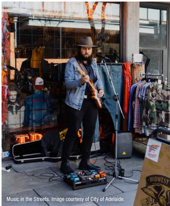
Music in the Streets.