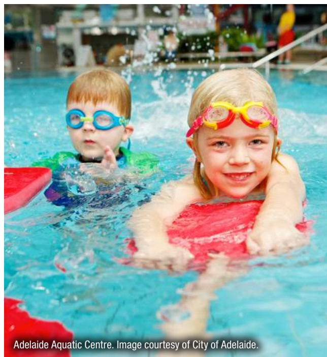
Adelaide Aquatic Centre.

The Adelaide Aquatic Centre delivered swimming lessons to more than 2,800 children, exceeding the pre-COVID-19 number of participants. Investigations of options for aquatic facilities proceeded throughout the year. The City of Adelaide is currently undertaking a detailed feasibility study for an aquatic facility at a new site in Denise Norton Park/Pardipardinyilla (Park 2). Council continues to advocate for funding from other tiers of government.