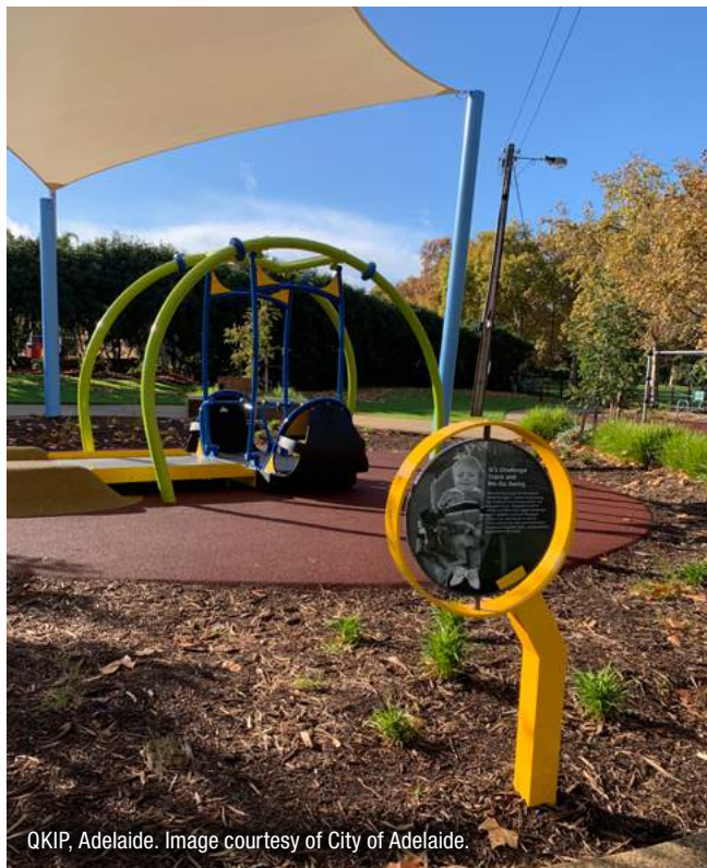
QKIP, Adelaide.