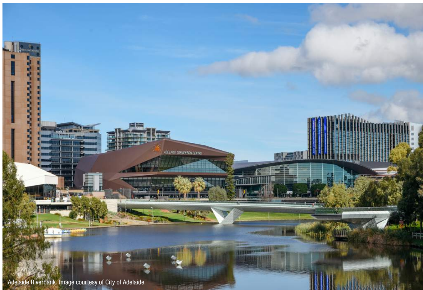
Adelaide Riverbank.

Collaboratively with the project working group and key precinct stakeholders, Baukultur prepared the Karrawirra Pari (Riverbank) Strategic Precinct Plan for the steering committee in March 2021.