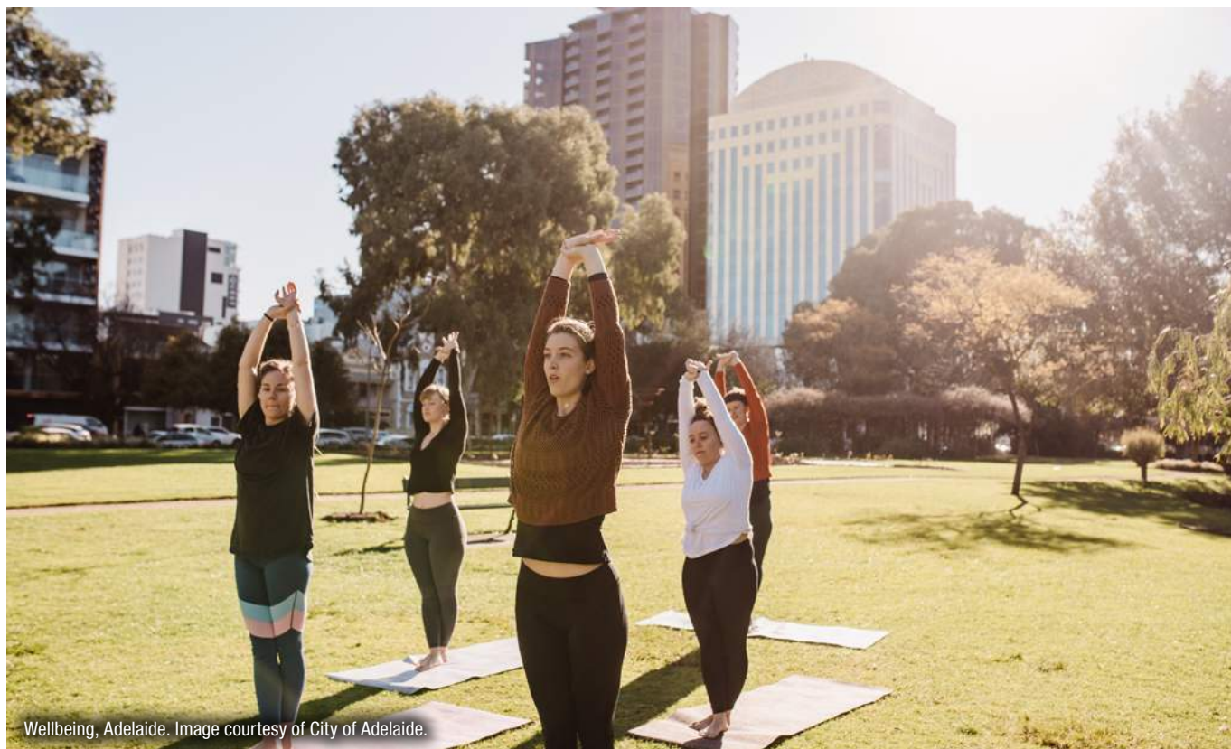
Wellbeing, Adelaide.