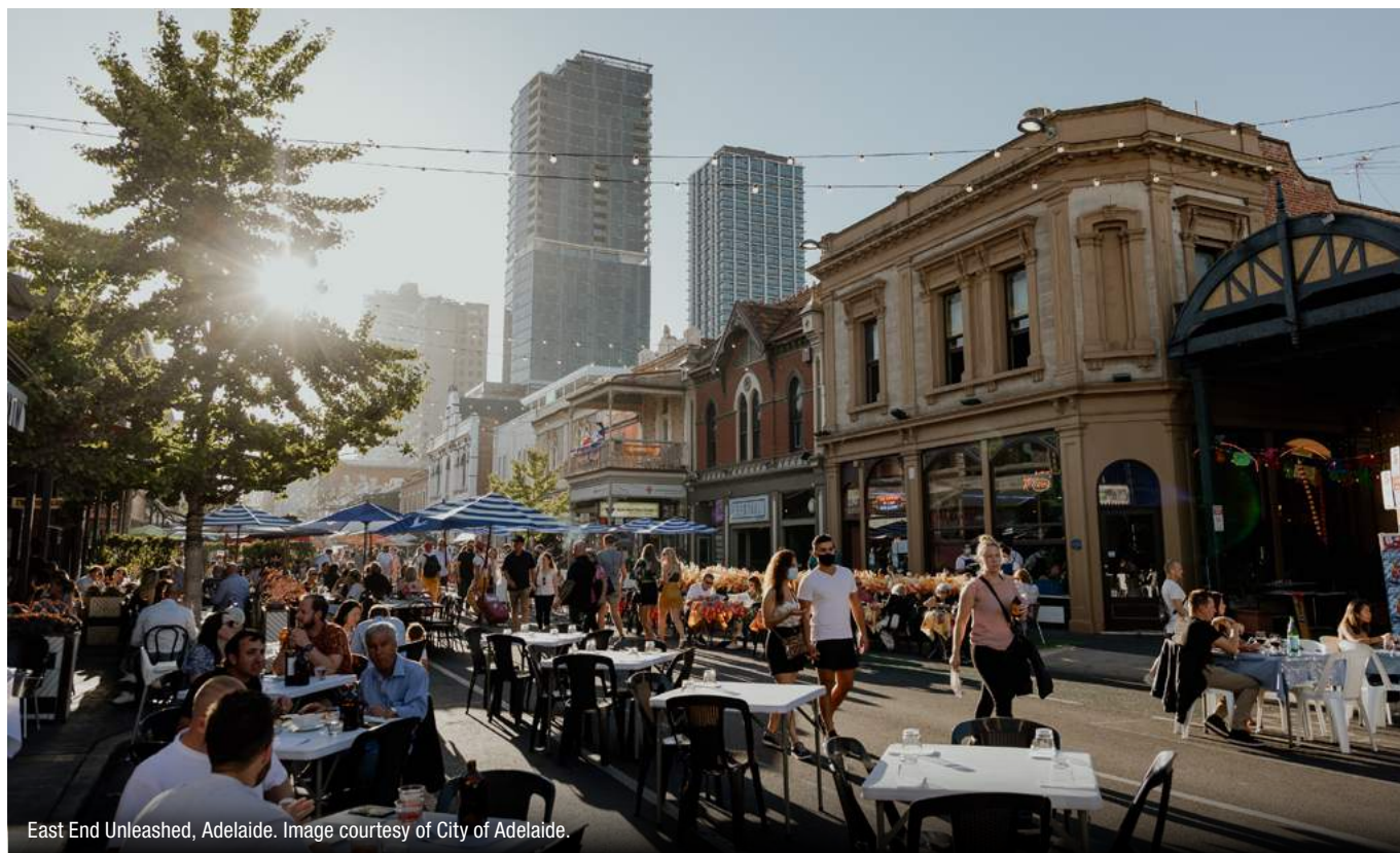
East End Unleashed, Adelaide.