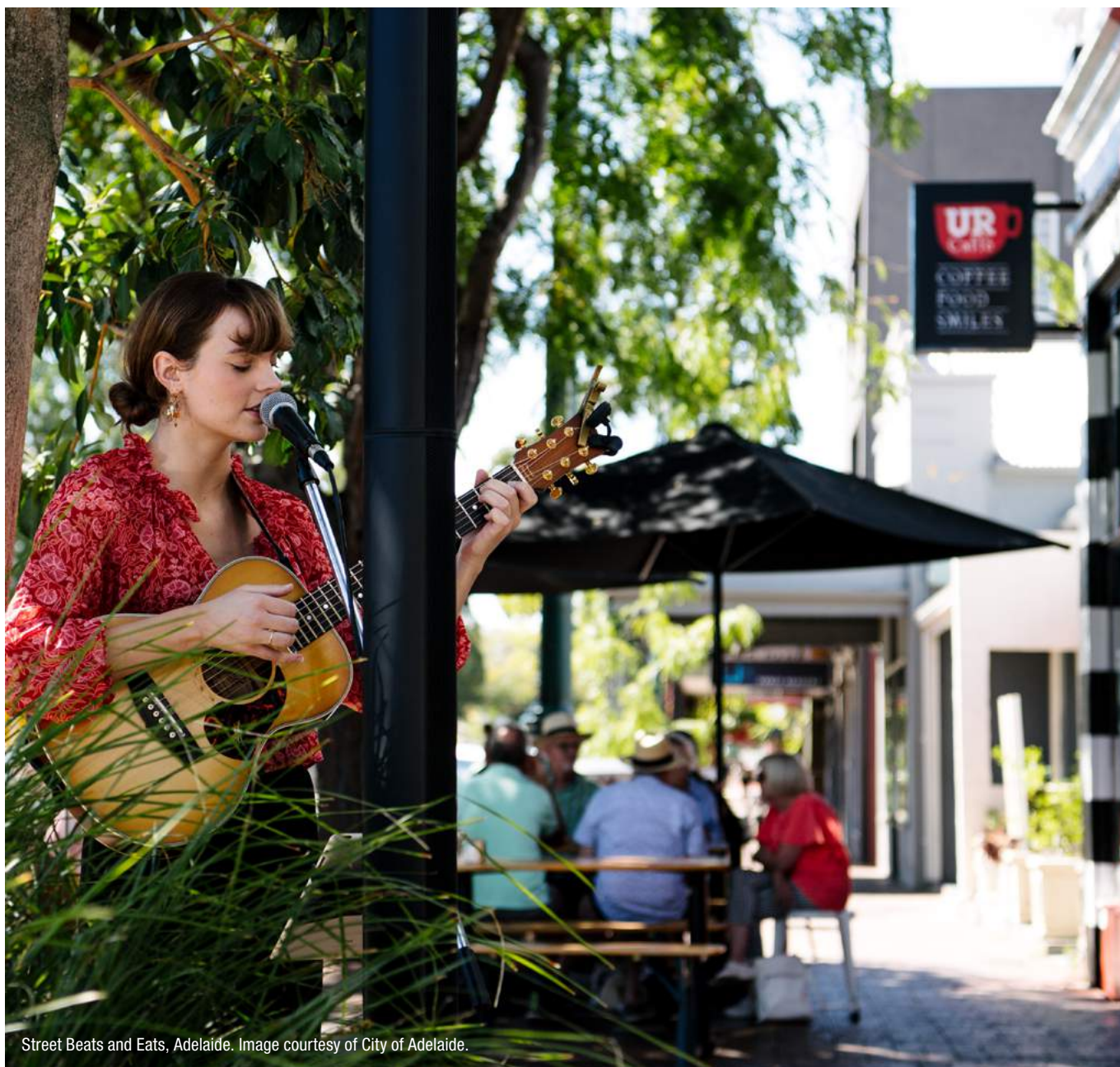
Street Beats and Eats, Adelaide.

The Capital City Committee administers no legislation.